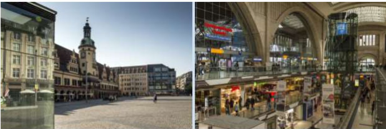
Leipzig is an old city of trade with numerous sights and a lively culture

The group completed a guided city tour of Leipzig. Leipzig has more than 1,000 years of history and is home to more than 600,000 inhabitants. It is the largest town in the Free State of Saxony and the heart of the Metropolitan Region Central Germany. With the new sites of BMW, Porsche and DHL, Leipzig has become an important and modern business location. The town was founded at the crossroad of two mediaeval trade roads, which dominated its development for centuries. Goods, people and ideas found their way to Leipzig and formed a self-confident urban citizenship.