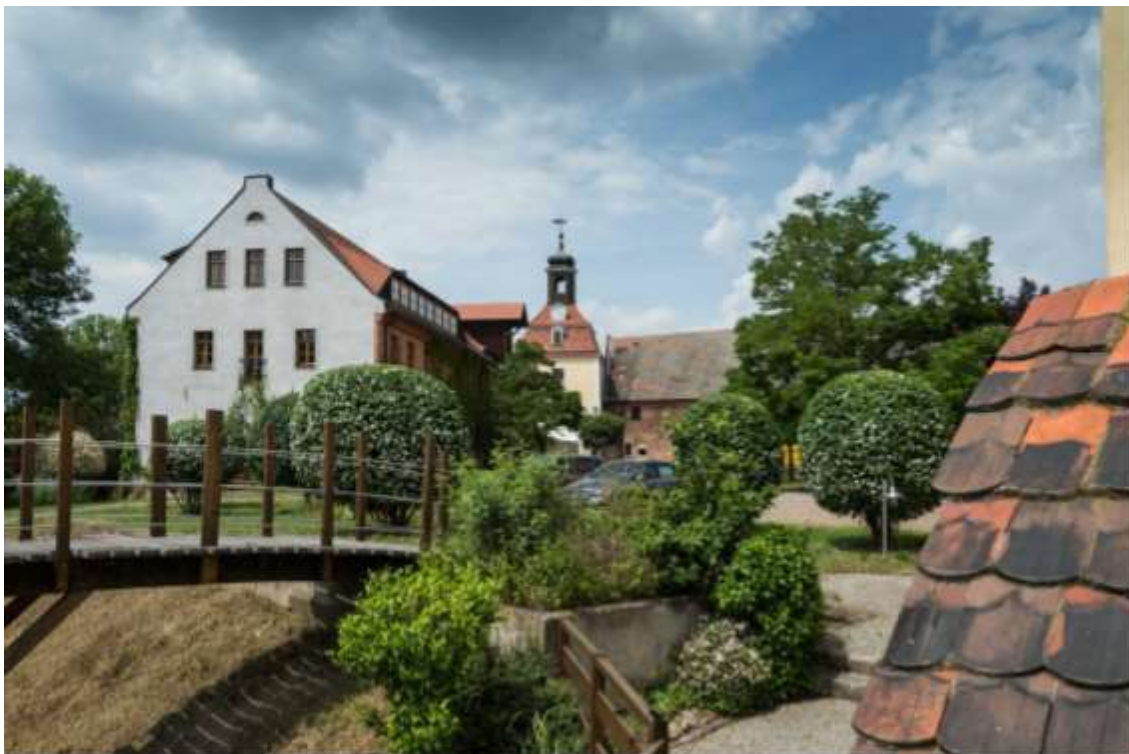
Gut Wehlitz - European center for projects in vocational training in Germany

The project focused on practical development and professional skills of the interns. Through the internships, participants combined their theoretical knowledge from school with international practical work experience in different professional fields. Soft skills and social competences were also developed. The professional, linguistic and social competences acquired in the process improve the employability of the interns on the national and international labour markets.