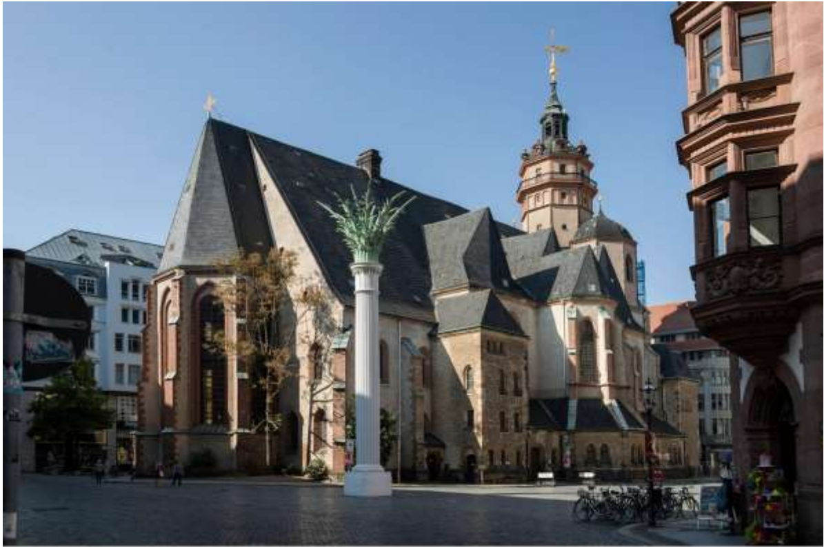
Church St. Nikolai was an important place in recent history